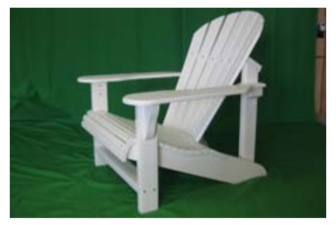
Step 4:: Attach the arms and go get a nice cool drink!