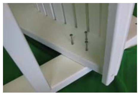
<u>Step 1:</u>: Lay the seat section on its side and slide the front leg section up into the seat slat gaps. Line up the pieces at the <u>match line</u> and tighten the screws. You should feel the screws find the original holes. Flip the assembly and fasten the other front leg screws.