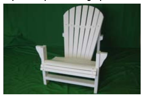
\underline{\text{Step 3:}} : Set the back section in place to attach - it may need to be squared up to line up screws. Fasten the lower short screws first and then line up the upper screws.