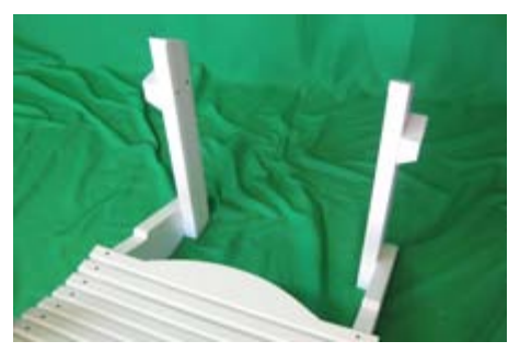
Step 2:: For the remaining pieces advance the screws until they protrude the other side slightly - this will help line up the pieces easier to their original holes. Attach rear legs - notice which way the top of the legs point.